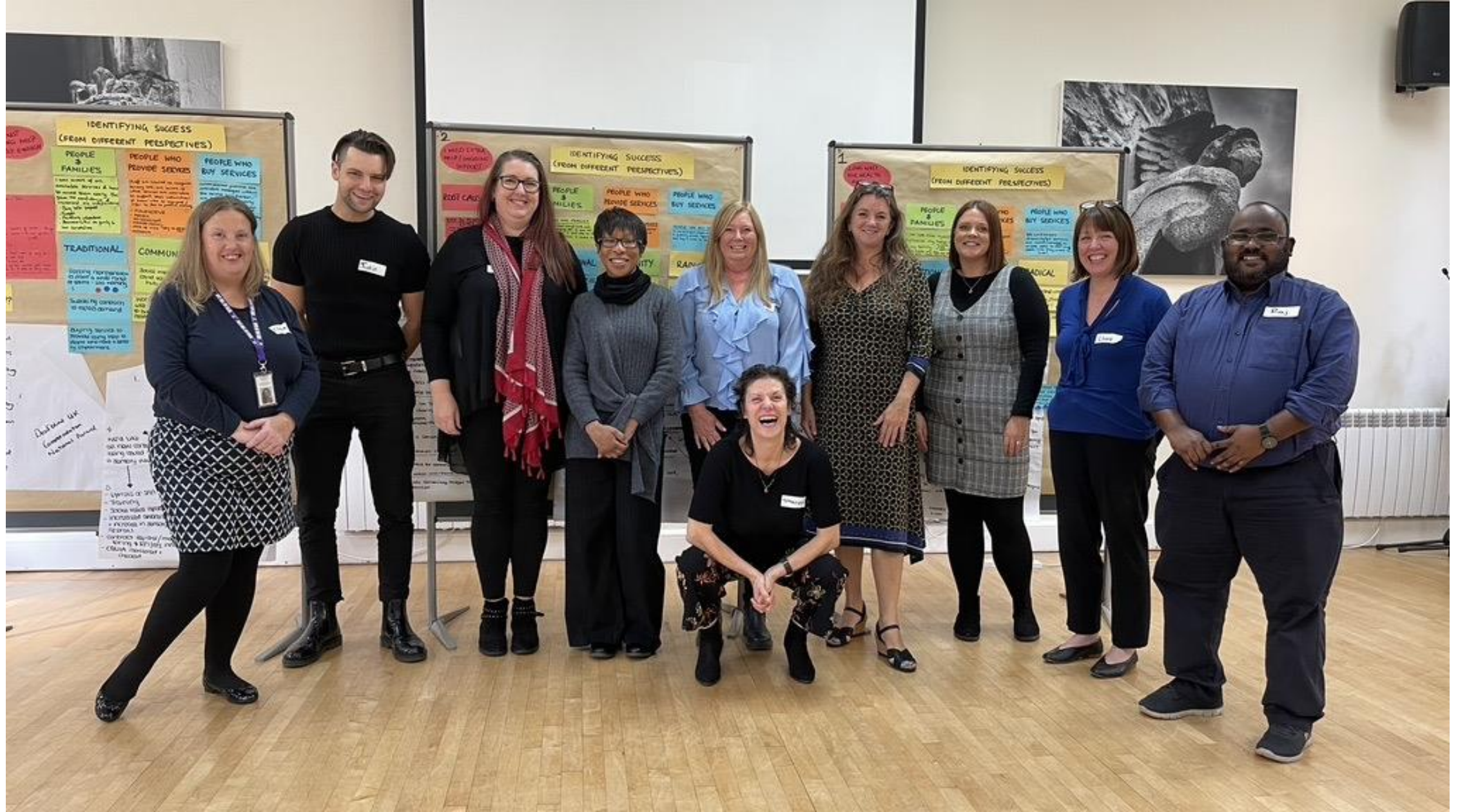
Video Explaining the process