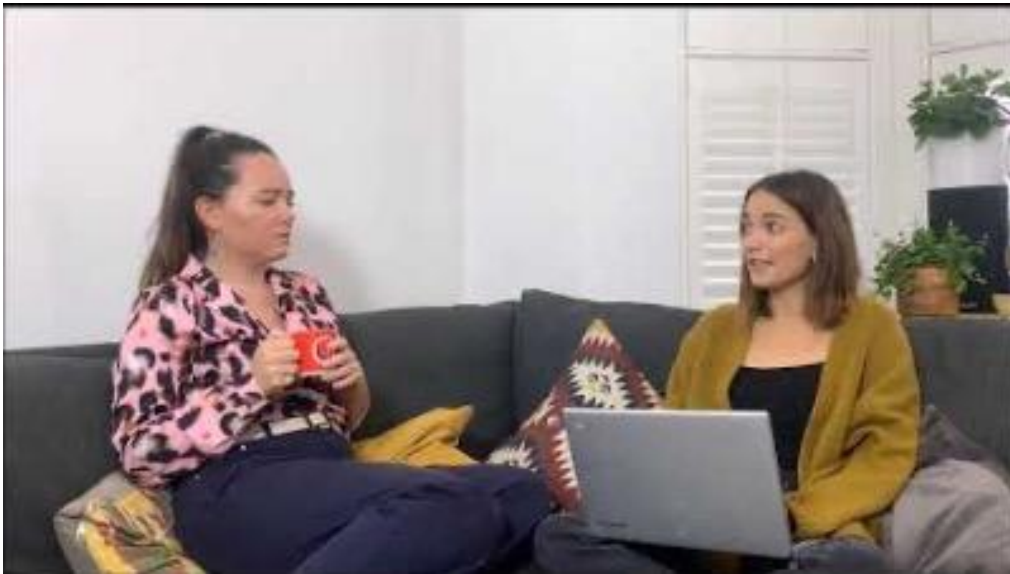
'Accessing the Community' - Service Speak - Oxfordshire Family Support Network (OxFSN)